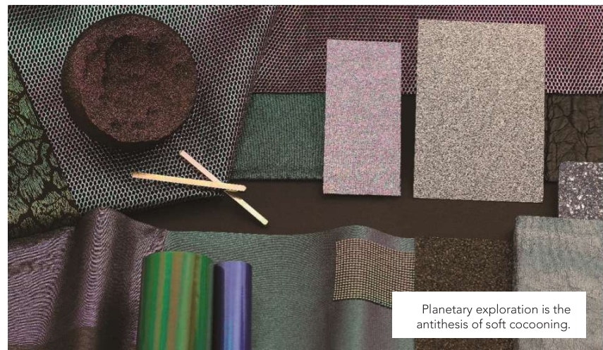
Planetary exploration is the antithesis of soft cocooning.