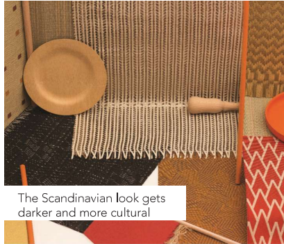
The Scandinavian look gets darker and more cultural