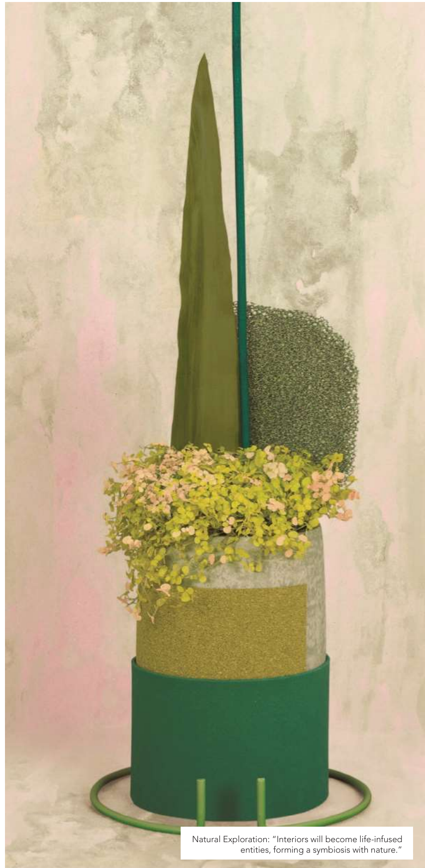
Natural Exploration: "Interiors will become life-infused entities, forming a symbiosis with nature."

Colours for Natural Exploration include mossy greens and intense woody browns.